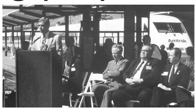
Flashback to 1993: Rod Diridon, current chair of the California High Speed Rail Authority, speaking on the occasion of touring German ICE train stopped in San Francisco in 1993.

Environmental groups, such as the Sierra Club, see HSR as a potential alternative