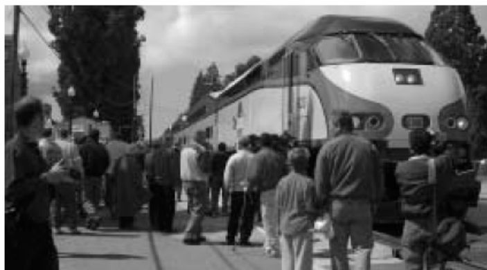
Caltrain Baby Bullet equipment debut, September 2003 — Margaret Okuzumi