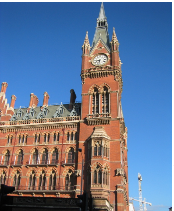
Restored St. Pancras Station, London.

trains and airlines in the UK and understands that the two modes compliment each other. LCR is also responsible for the development of the property around the stations.