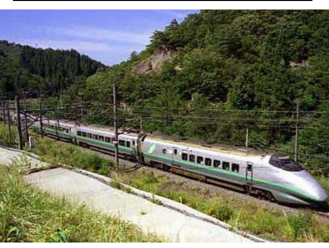
JR East 400 series "Mini-Shinkansen" train on the re-gauged Ōu Line to Yamagata.

Similarly, the Akita Shinkansen runs 6-car E3 Komachi (Belle) HSTs coupled with full-sized E2 HSTs in 171 mph Hayate (Fast Wind) service to Morioka. From there, the Komachis travel on the re-gauged Taza-